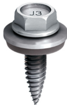
FIGURE 13—JF3-2 SCREW