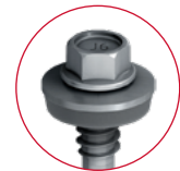
Self-drilling screw JT6-D-6H-5.5/6.3

A4 stainless steel available upon request