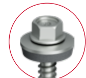
Self-drilling screw JT3-6-5.5