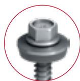
Self-drilling screw JT6-6-5.5 | Page 135