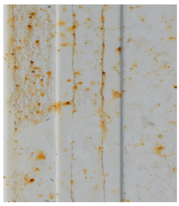
Corrosion of drilling swarf If drilling swarf is not removed from the roof surface, it will begin to corrode and this can lead to complaints.

With the new generation of self-drilling screws, this problem is a thing of the past. The slim, single-fluted drill tip of the EJOFAST<sup>®</sup> self-drilling screws produces no sharp-edged swarf that gets stuck in the material. This makes assembly much more efficient, as cleaning work to remove swarf is significantly reduced.